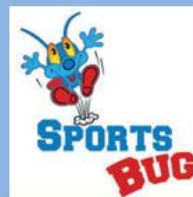
Mr Bolton Sports Bug